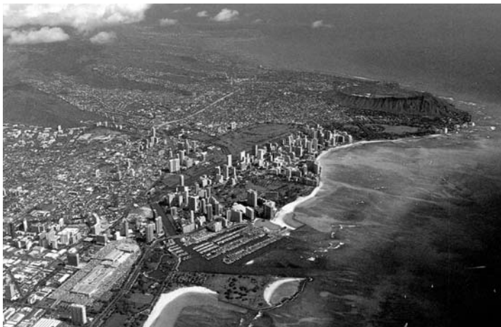
An early preview of coming attractions:

Come and visit the Aloha State for the 2003 Fall Biennial Congress and enjoy all of the hospitality the Aloha Chapter has to offer. The weekend will be casual and relaxed with just enough to pique your interest in Hawaii's land economics, its fascinating history and its unique culture. But don't just come for the weekend; bring your family or friends and plan on coming early or staying afterwards to enjoy our beautiful Neighbor Islands.