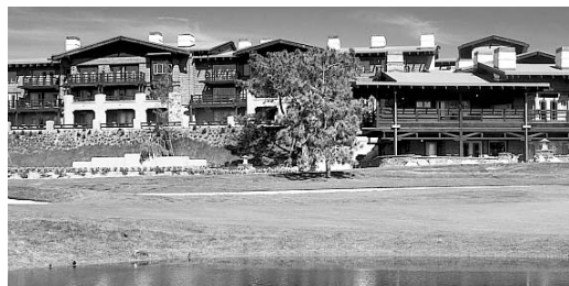
The Lodge at Torrey Pines Golf Course. This five-star hotel is a great example of the California Craftsman style of architecture.