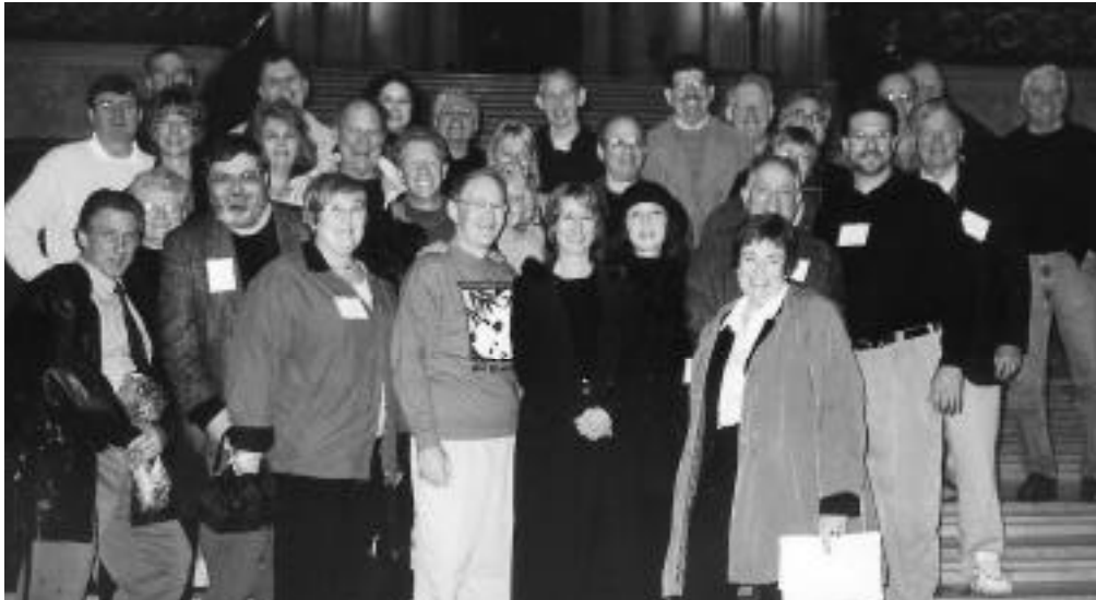
The marble staircase in the City Hall rotunda was perfect for a group photo.

The next Weekend Experience will be combined with our Biennial Congress October 11-13 in Philadelphia. In May 2002 our host will be the Vancouver Chapter. Mark your calendars and plan to attend!