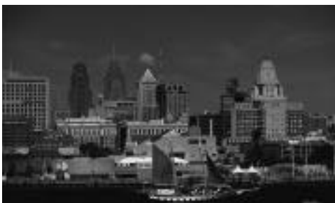
Philadelphia, fifth-largest city in the United States