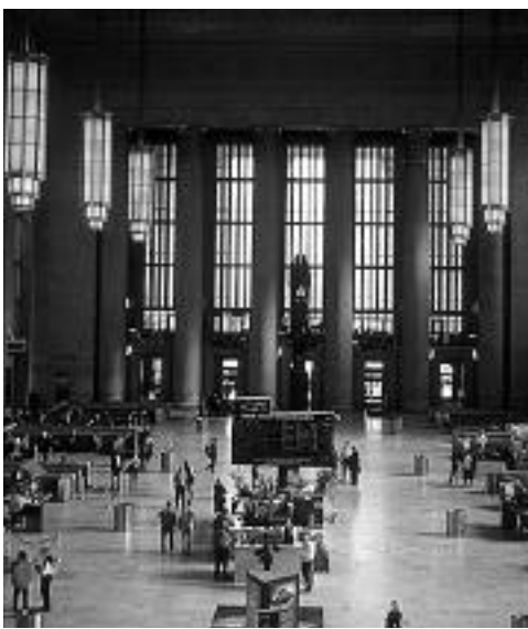
The newly renovated 30th Street Station