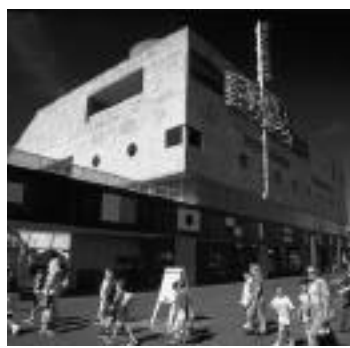
Independence Seaport Museum on the banks of the Delaware River

A mobile workshop beginning at 10:30am takes us first to Conshohocken, then on to Manayunk nestled along the banks of the Schuylkill River. This new hot spot, named a National Historic District in 1983, has more than 65 boutiques and restaurants. The tour contin-